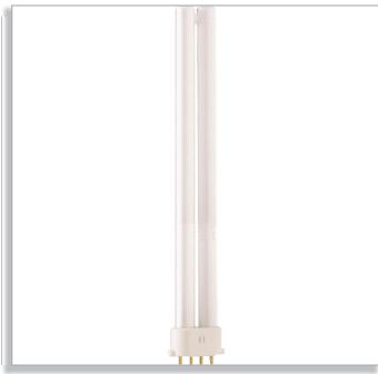
11W, 2G7, 4P