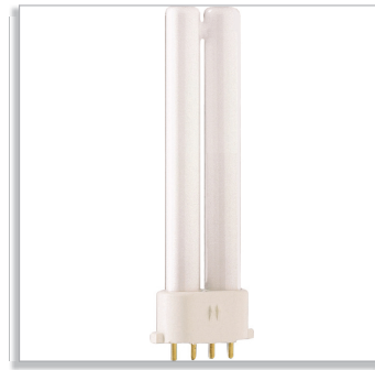
7W, 2G7, 4P