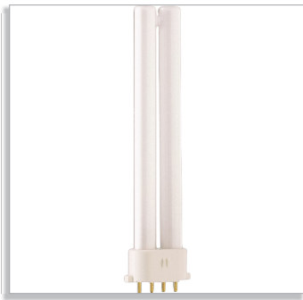
9W, 2G7, 4P